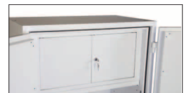
Optional Coffers** (FS1512/13/14 only)